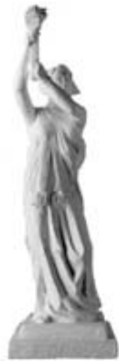
This statue is a replica of the statue created by student activists and destroyed by communist tanks in Tiananmen Square in 1989.