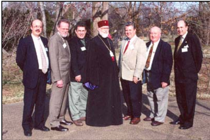
CORA Meeting (from left to right)