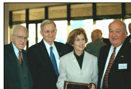
CEEC Meeting (from left to right) Participants at the CEEC Conference, Congresswoman Constance Morella (R-MD), CORA President Armand Scala

Senator Chuck Hagel (R-NE) and Congressman Joe Knollenberg (R-MI) then delivered remarks. They addressed the many important contributions that U.S. foreign policy has made to Central and East Europe. Following, the second panel discussed U.S. foreign assistance programs to Central and East Europe, the elimination of the Jackson-Vanik amendment and the granting of Permanent Normal Trade Relations (PNTR) to those countries yet to attain that status.