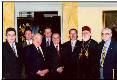
Participants at a luncheon at the Metropolitan Club in Honor of the President of Romania (from left to right)